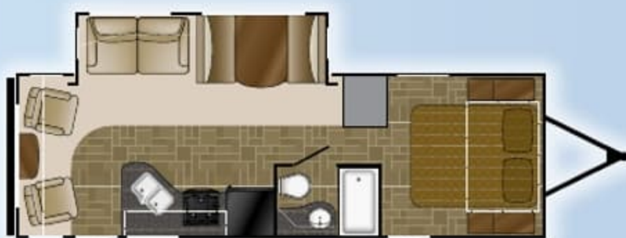
NT 26 LRSS

Length: 36' 8" Dry: 6,950 Height: 10' 10" Hitch: 780 GVWR: 8,600