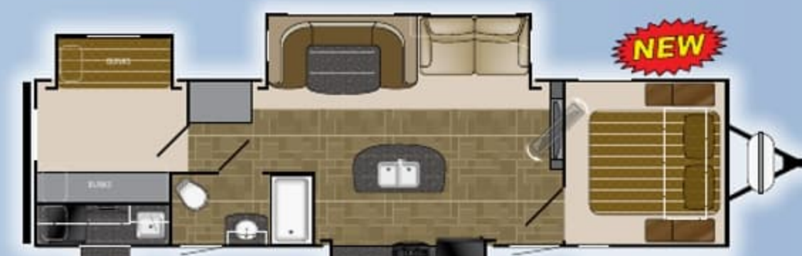
NT 33 BKSS

Length: 35' 11" Dry: 6,399 Height: 10' 10" Hitch: 652 GVWR: 8,600