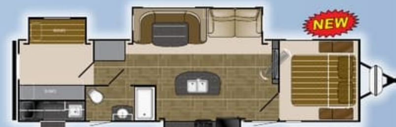
NT 33 BKSS

Length: 35' 11" Dry: 6,399 Height: 10' 10" Hitch: 652 GVWR: 8,600