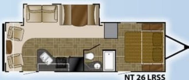
NT 26 LRSS

Length: 36' 8" Dry: 6,950 Height: 10' 10" Hitch: 780 GVWR: 8,600